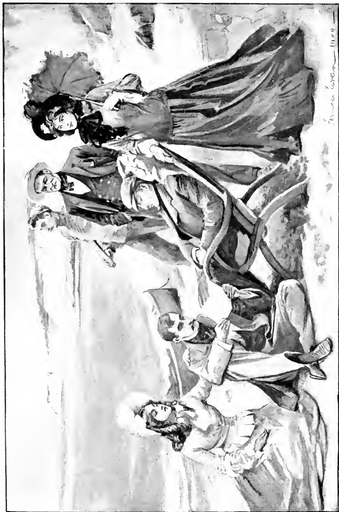
"Frank . . . . drew a letter from his pocket, and began to read."